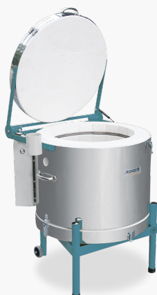
Similar to illustration