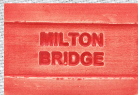
M007 Red Alert