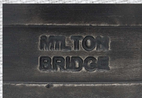
M008 Black Velvet