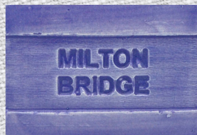
M010 Purple Rain