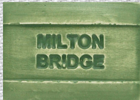
M006 Green Eyes