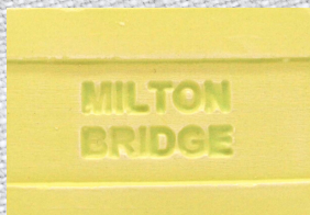
M009 Lemon Song