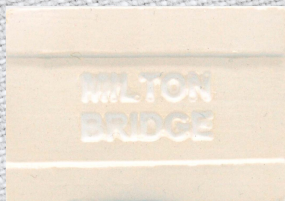
M004 White Wedding