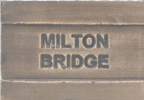
M012 Fade to Grey

Please note every effort has been made to make the colours representative of actual product. However the colour reproduction method does not always allow for this. Variations in the firing process can result in a deviation to the colour achieved.