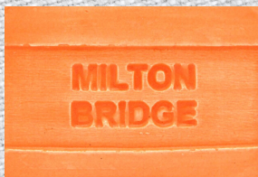
M011 Orange Crush