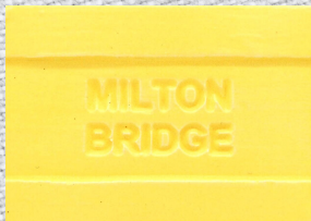
M002 Yellow Submarine