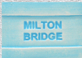
M001 Blue Monday