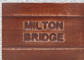
M003 Brown Sugar