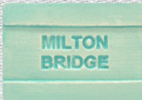
M005 Blue Suede Shoes