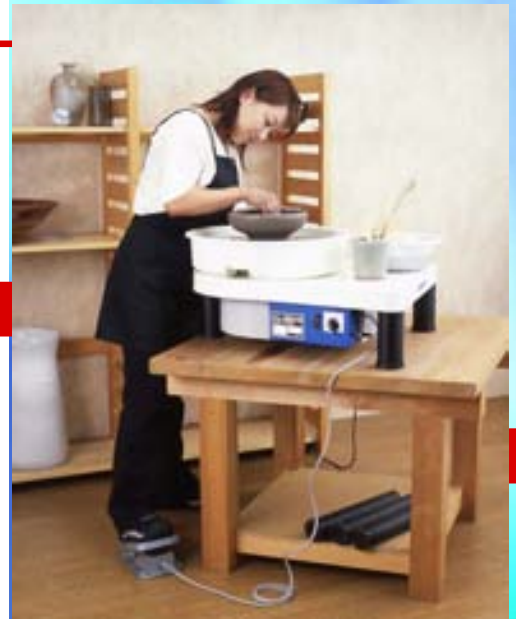
Adjustable height with table-top position.

You can adjust the wheel height to a comfortable position.